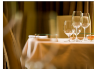
An image may look correct on screen.

The analyser to access the colours output on the paper surface then uses this test print.