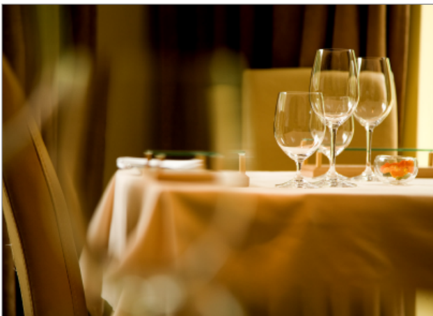
Calibration of your monitor will make colour adjustment more accurate resulting in superior prints

Calibration is basically a controlled way to make sure that what you see on your screen is what the photo lab will see on their screen, as the lab will have to calibrate their systems as well to guarantee the image quality day after day.